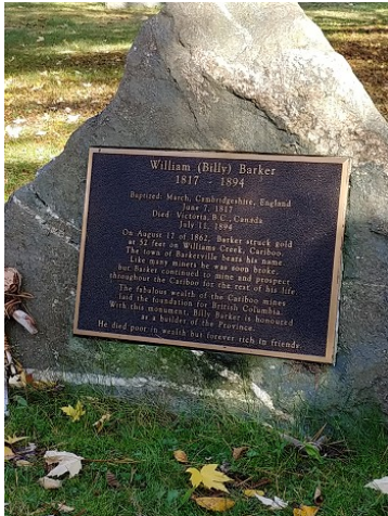
Billy Barker's grave