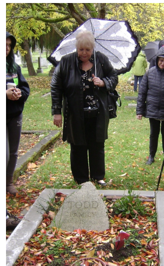
The psychic sensed strong energy at the Todd family grave.