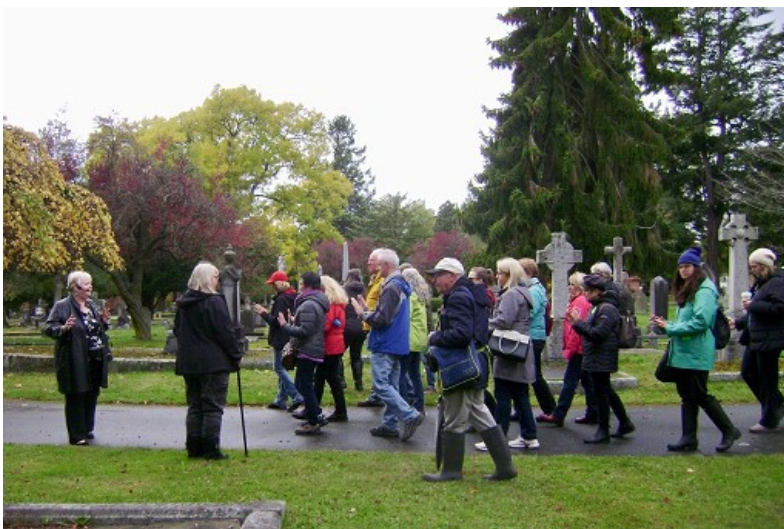
The psychic had everyone walk toward her with their hands up to see if they can feel a change in the energy where she is standing.