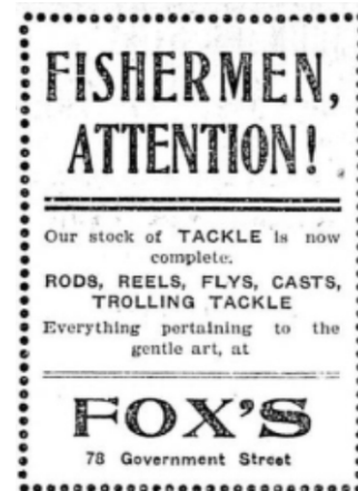
Daily Colonist 20 March 1907