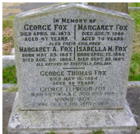
Plot A 76/77 E 31 Ross Bay Cemetery