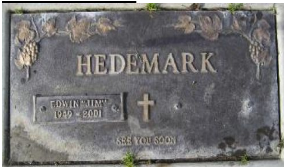
Tucolay Cemetery, Napa, California